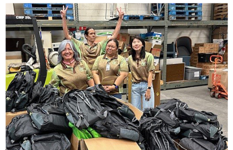
The HIFICU Marketing Department at Helping Hands Hawaii.